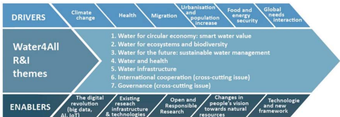
Figure 1 – Water4All RD&I's themes, drivers and enablers

Among its activities to produce these outcomes, Water4All will launch a series of annual Joint Transnational Calls (JTCs) pooling national financial resources through the participation of ministries, authorities and funding organisations. These calls primary aim at strengthening the water RD&I collaboration and producing and sharing top class water-related knowledge and data. The topics for the calls will be drawn from the water challenges identified in the Water4All Strategic Research and Innovation Agenda (SRIA, publication foreseen February 2022; see figure 1).