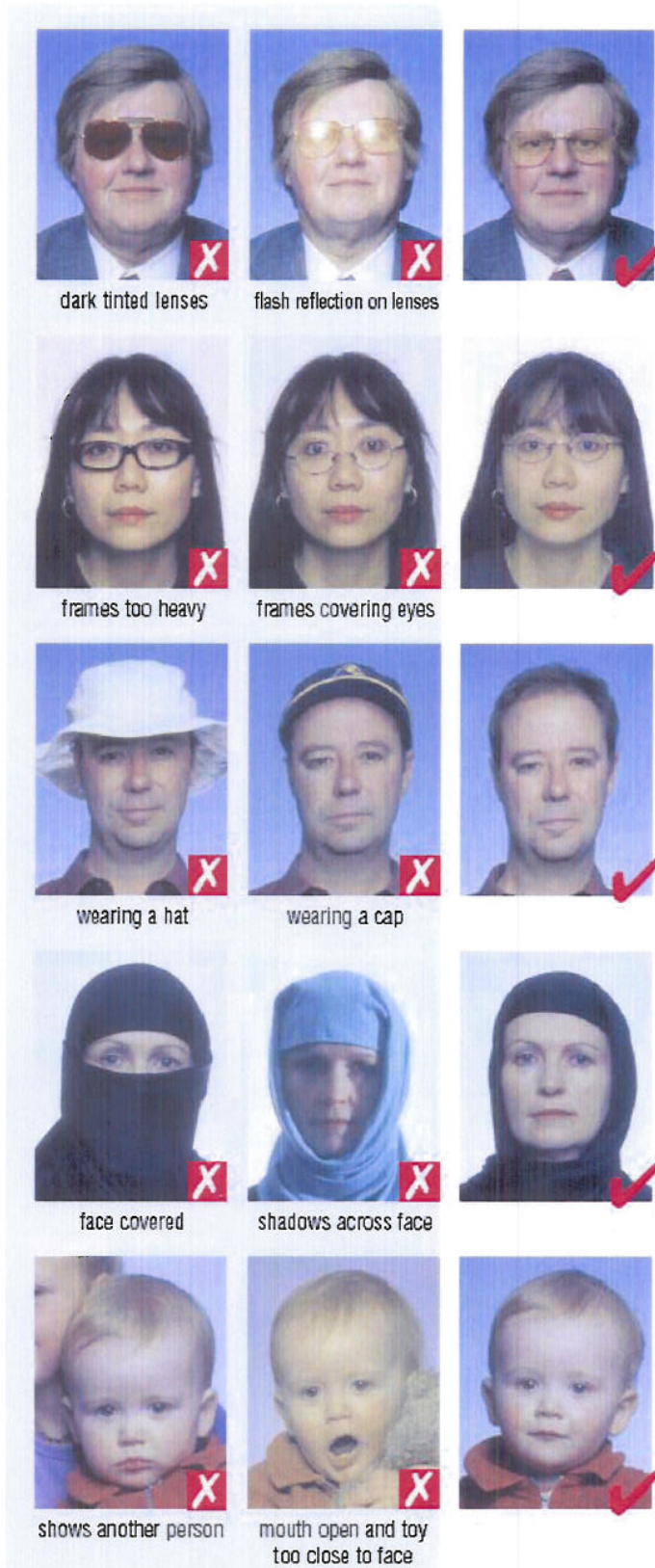
Figure 11 (45 images) – Best practices for the purpose of travel document creation.