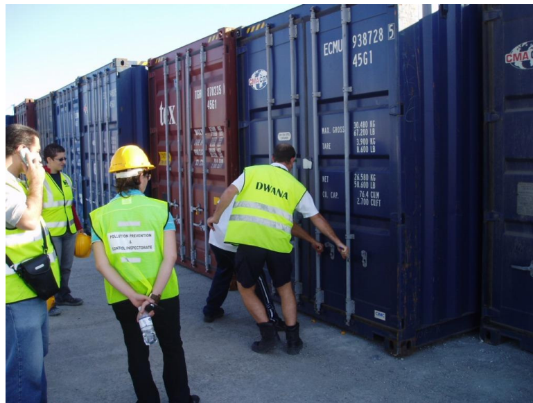
Photo 2.1 Inspection at a container terminal

A description of these methods is enclosed in annex 2.