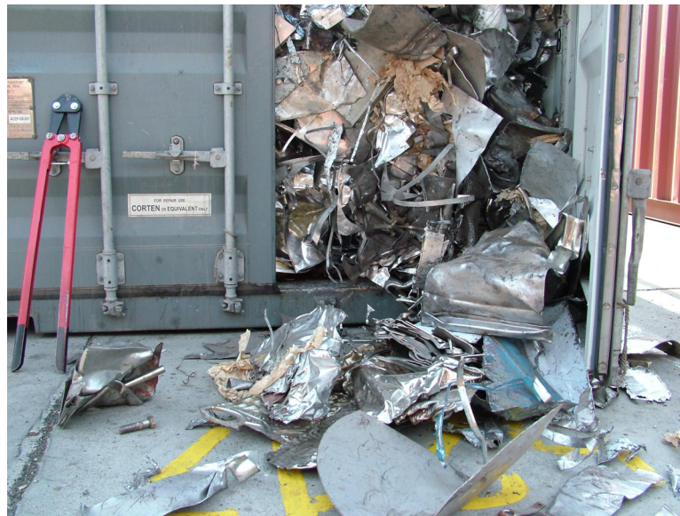
Photo 2.2 Iron or steel scrap from Poland to South Korea

In total, 24.052 administrative/ document checks and 4.198 physical checks have been carried out. During these physical checks, 1.103 shipments of waste were identified. 564 of these shipments were found to be illegal (51%). 473 shipments were detected with infractions (43%), like missing or incomplete information with respect to article 11 of the Regulation 4 . Follow up actions were taken in these circumstances, like returning illegal shipments to the country of origin.