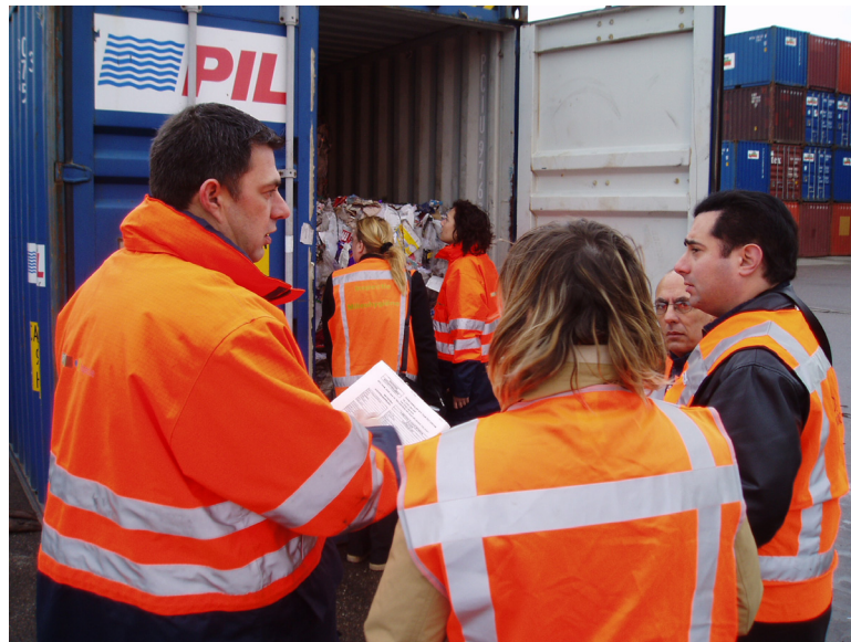
Photo 2.3 Exchange of information between inspectors of various countries

In the course of the project a number of international exchange programmes/meetings were organised. Most visits focussed on the exchange of inspectors and by doing so: learning from their counterparts. The exchange programmes were also useful to experience and discuss the international cooperation with customs, police and the environmental inspectorates. In some cases the exchange of signals between the project participants prevented port hopping.