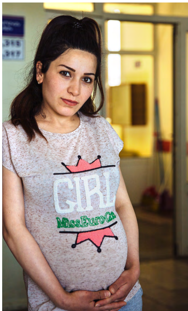
● Young woman wears T-shirt announcing she is expecting a girl at the Republican Maternity Ward