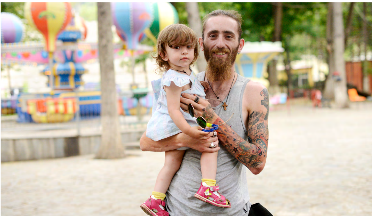
● Georgia, 2016

Legal bans on sex-selective abortions, sex determination and its advertisement, as well as regulation on late abortions are obvious policy options for targeting prenatal discriminatory behaviour and several countries have introduced such prohibitions. Bans also send a clear signal of governments’ official position towards sex selection and provide a basis for inter-ministry cooperation around issues of gender discrimination. However, the experience of Asian countries shows that such bans are difficult to implement, fraught as they are by high administrative expenses, deficient targeting and the risk of infringing on reproductive rights. In addition, further technological advances, such as fetal blood testing for the identification of an embryo’s sex or assisted reproductive technology, may render such policies obsolete in the near future.