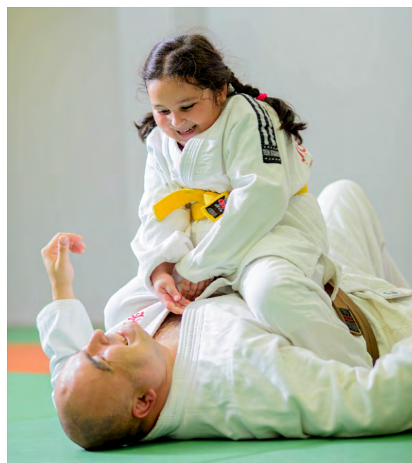
● Azerbaijan, 2017

An additional challenge relates to the long delay in identifying and acknowledging the rise in birth masculinity in the EECA region, a delay attributable to the lack of adequate statistics due to social and political disturbances, and of in-depth field studies on gender bias. The focus of population policies tends to be placed instead on the issue of population decline, with prenatal sex selection seen as a minor problem reflecting private family decisions rather than wider social implications. Even when aware of the extent of prenatal gender bias, governments have often been hesitant to devise specific interventions. In addition, policy experience in Asian countries such as China and India shows that there is no "silver bullet" to reduce elevated SRB levels and redress gender discrimination.